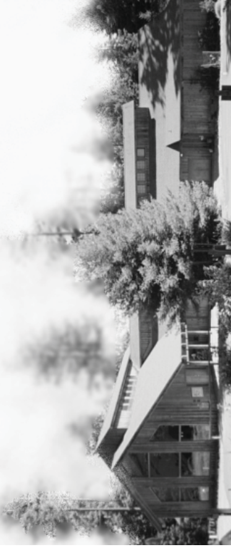
Promoting public interest and participation in the arts since 1961.

The Gualala Arts Center is open weekdays from 9 a.m. to 4 p.m. and most weekends from 12 to 4 p.m. Visitors are always welcome. The current calendar of exhibits, concerts, plays and classes can be found at GualalaArts.org , in the Sketches newsletter, or by calling (707) 884-1138. Membership is open to all. The Arts Center may be rented for weddings or private social events.