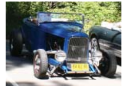
Hot Rod 1932 through 1942

C'mon, you all know what a Hot Rod is. It can be any period correct body style (roadster, coupe, sedan, pickup, panel truck, cabriolet, etc.).