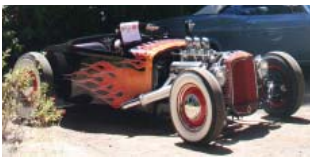
Hot Rod Pre 1932