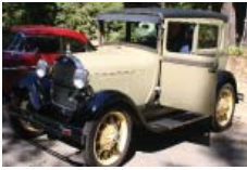
Stock 1949 and earlier