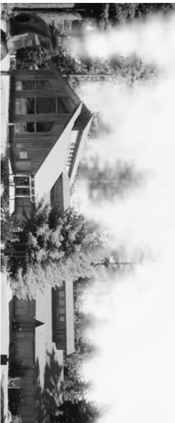
Promoting public interest and participation in the arts since 1961.

The Gualala Arts Center is open weekdays from 9 a.m. to 4 p.m. and most weekends from 12 to 4 p.m. Visitors are always welcome. The current calendar of exhibits, concerts, plays and classes can be found at GualalaArts.org, in the Sketches newsletter, or by calling (707) 884-1138. Membership is open to all. The Arts Center may be rented for weddings or private social events.