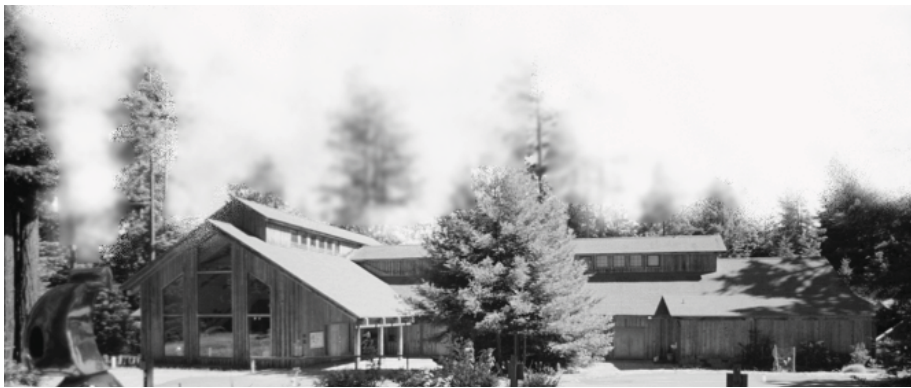
Promoting public interest and participation in the arts since 1961.

The Gualala Arts Center is open weekdays from 9 a.m. to 4 p.m. and most weekends from 12 to 4 p.m. Visitors are always welcome. The current calendar of exhibits, concerts, plays and classes can be found at GualalaArts.org , in the Sketches newsletter, or by calling (707) 884-1138. Membership is open to all. The Arts Center may be rented for weddings or private social events.