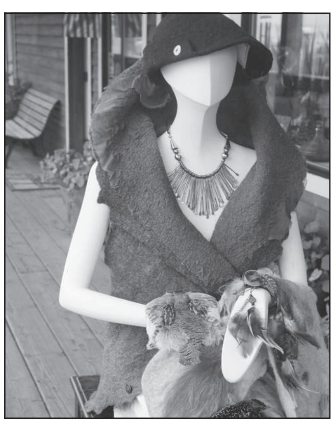
One Weave will display vintage clothing in the vendor area.